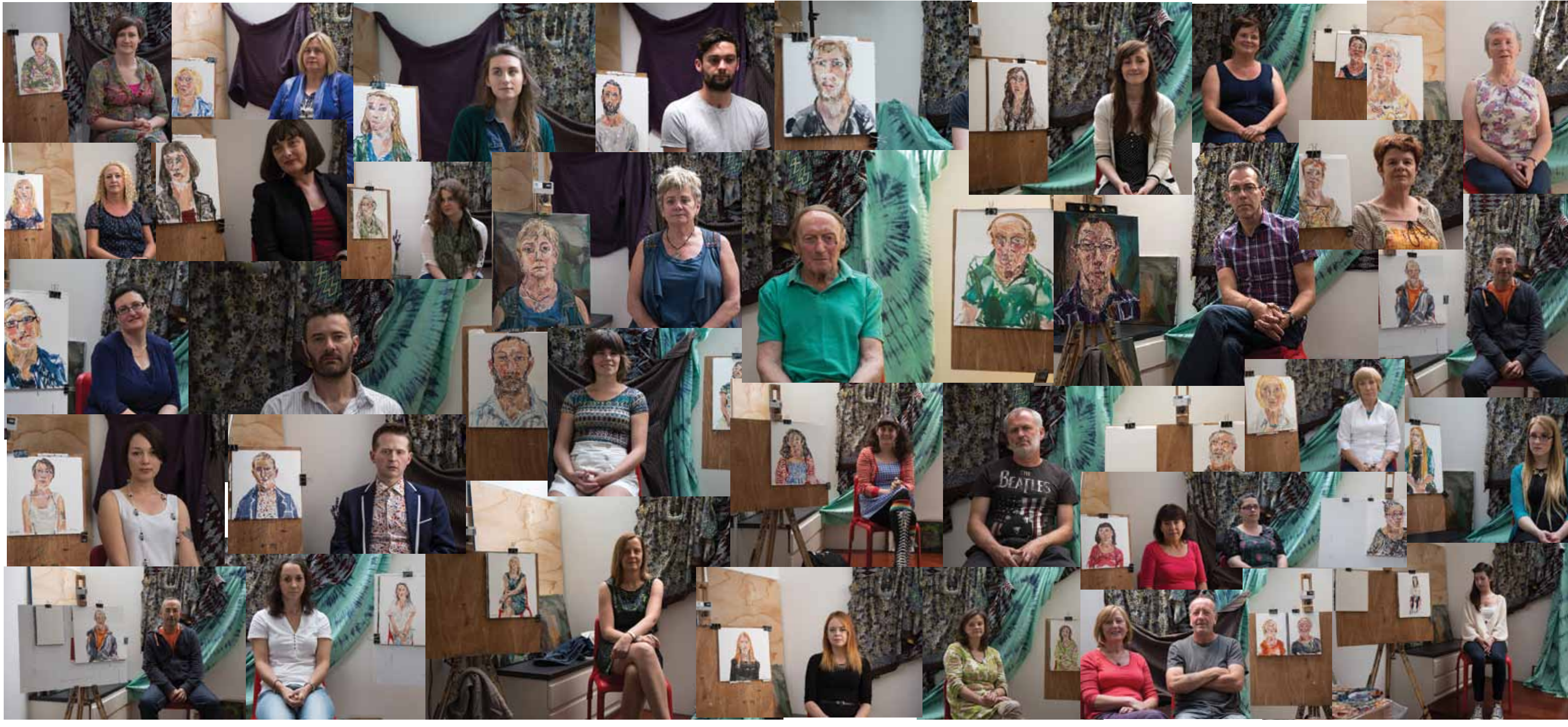
Fifty members of public canvas for portraits at the Laois Arthouse